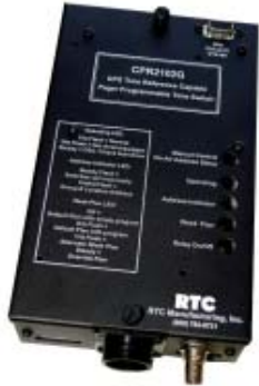
CPR2102 Time Switch