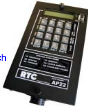
AP22 Time Switch